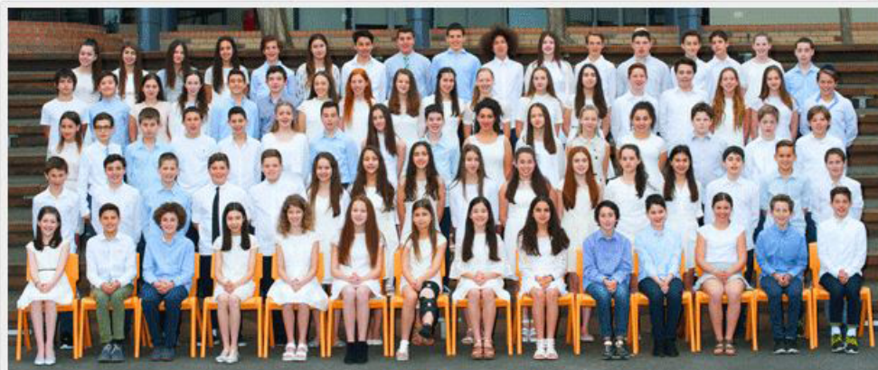
The B'nei Mitzvah group

The Year 7 B'nei Mitzvah program at Melbourne's Bialik College is a year-long journey of self-awareness and learning that culminates in a special ceremony.